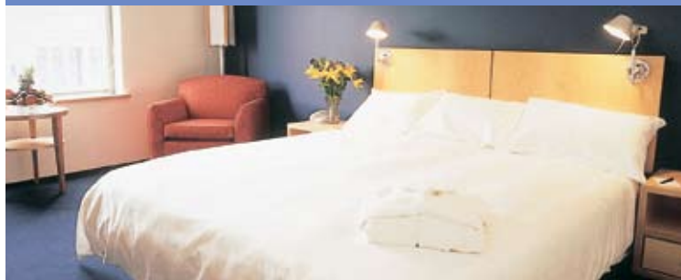
Comfort, well-being, space