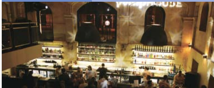
Hospitality, welcome, friendliness